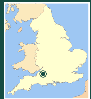
Avalon House, North Somerset

Learning: Successful boiler position and water tank positioning has been key